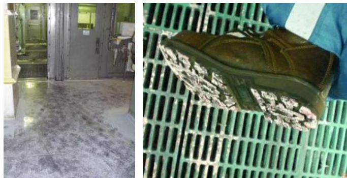
Paint Overspray and Paint Tracking Damage 油漆过喷和油漆足迹污染

产品: BoothSaver™ 2029 鞋套薄膜能有效防止工作鞋带入污染，使用快速、便捷。此产品可黏附在工作鞋上进入车间区域，包裹鞋上的污染物防止其进入喷房。也可在进入喷房时临时性的包裹工作鞋，防止油漆带出。撕拉线的设计去除了刀具的使用。该产品无纤维、可安全用于喷房。